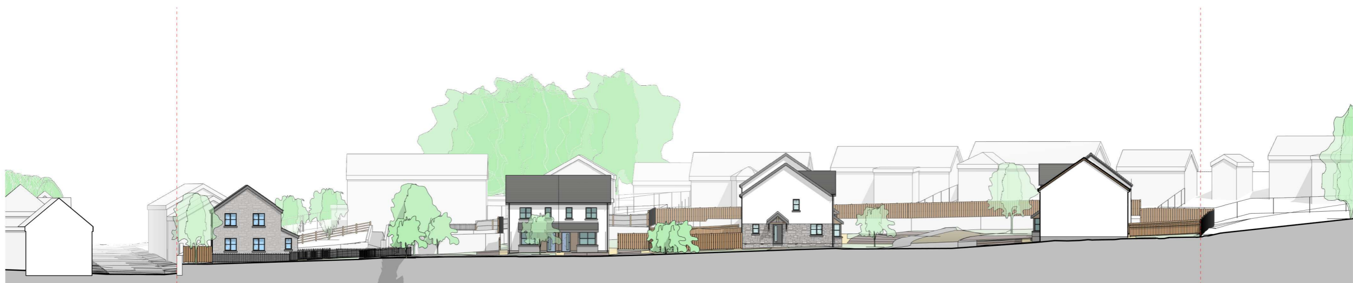
2 | LONG SECTION SCALE: 1:200