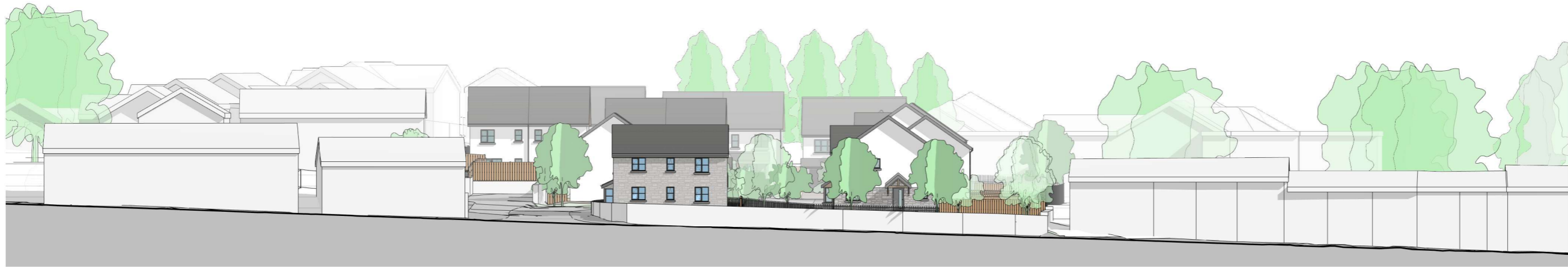
1 | ALONG RHOS STREET SCALE: 1:200