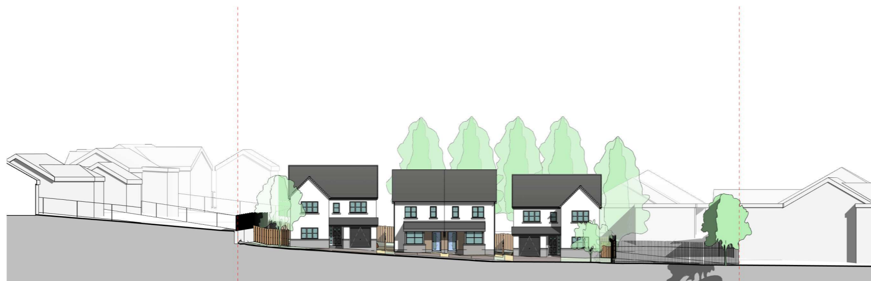
3 | SHORT SECTION SCALE: 1:200