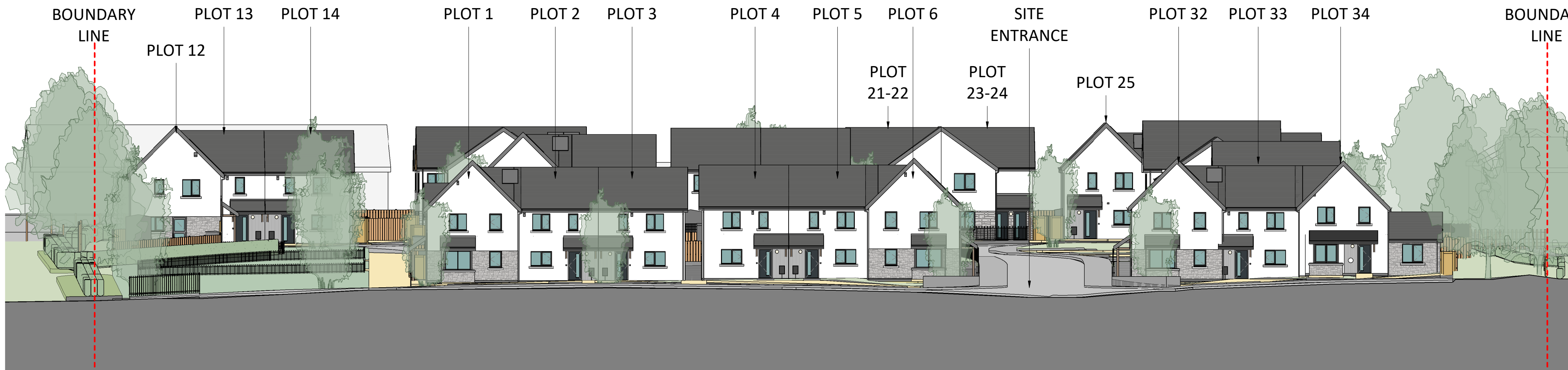
3 | STREET ELEVATION - LOOKING SOUTH EAST AT FRONT OF SITE SCALE: 1:200